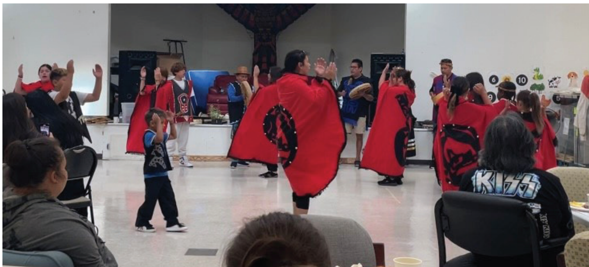
Pictured: Homalco Culture Dancers from the Community Food Network Gathering in Homalco on September 14, 2024

Please reach out to Ohshpaapineese - Debbie Minton DebbieM@nautsamawt.com if you have any questions