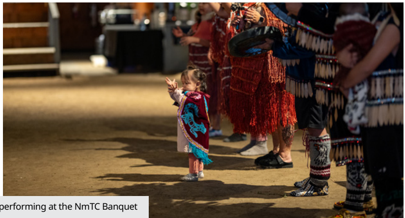
Tsatsu Stalqayu (Coastal Wolf Pack) performing at the NmTC Banquet